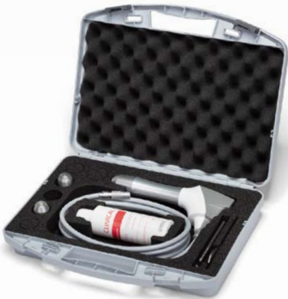
Illustrations show different equipment